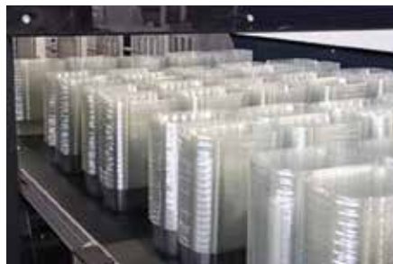
Easy stacking, ergonomic packing