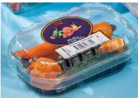
Combined perimeter- and hole-punching with KES

Suitable for SPEEDFORMER KMD 78, KMD 85 and KMD 90 and also for thermoforming machines from other suppliers.