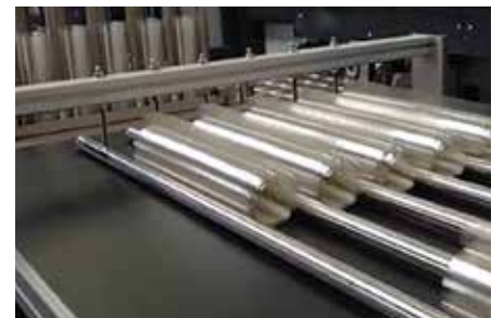
Horizontal product stacking function