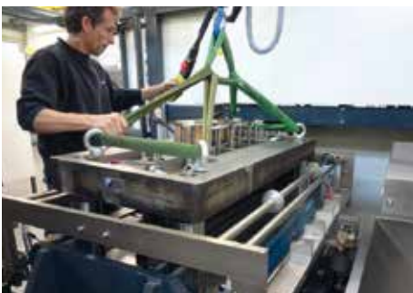
Fast and easy tool change