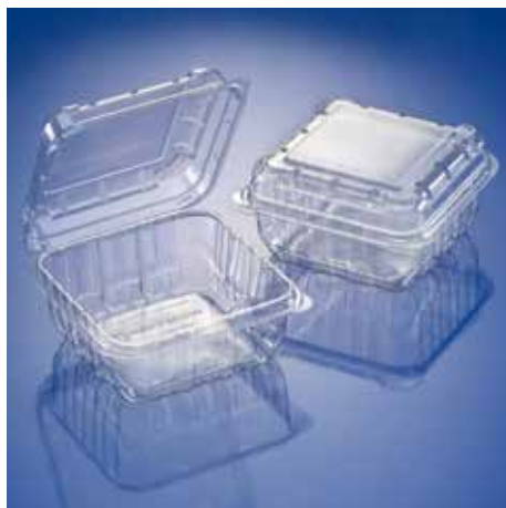
Perfect product quality