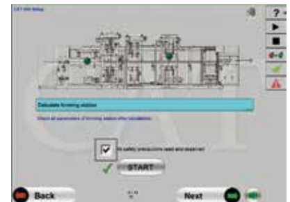
Auto teaching of machine parameters