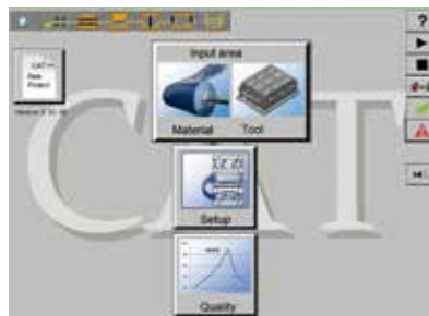
Entering of basic tool and film data

CAT Computer Aided Teaching The smart solution for high quality products