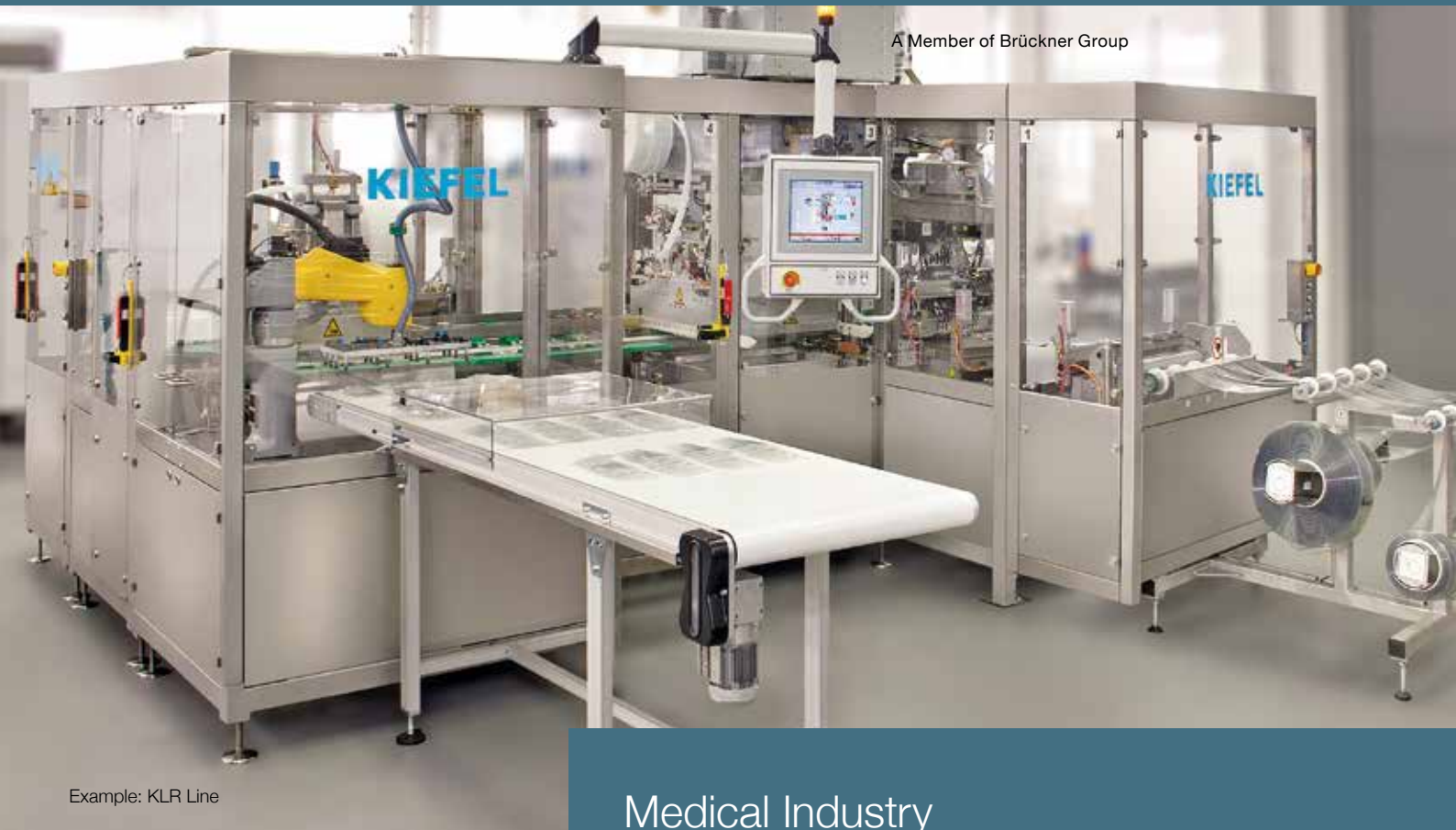
Example: KLR Line