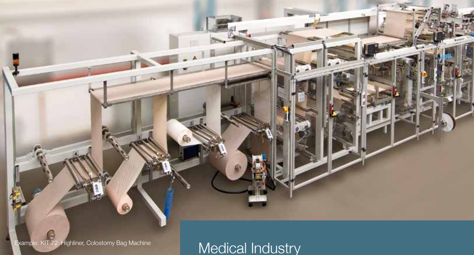
Example: KIT 72 Highliner, Colostomy Bag Machine